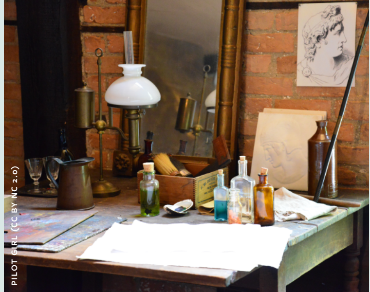
PILOT GIRL (CC BY-NC 2.0)

An excellent example of this is their existing Hudson River School Art Trail, which encourages people to discover 20 iconic landscapes that inspired 19th-century painters by going on hikes. The Art Trail and its collaboration with area parks is an offering that is enormously appreciated now,