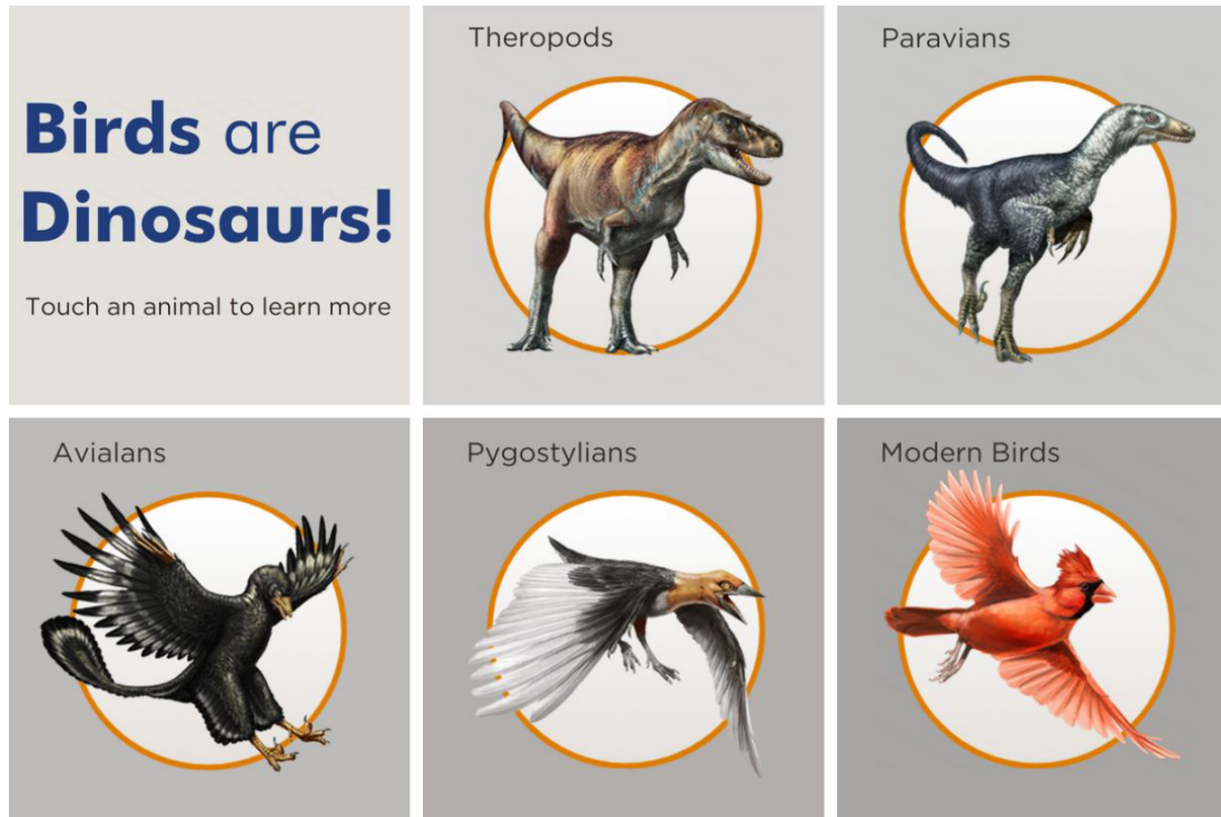
Fig. 2. “Birds are Dinosaurs,” which illustrates evolutionary change, is one of the touchscreen experiences we migrated to CMC In Hand.

been upgrading core systems and anticipating an app project in the future. The idea of an app had become our conceptual junk drawer. Guests rarely asked for one, and we hadn’t yet surveyed them about their preferences.