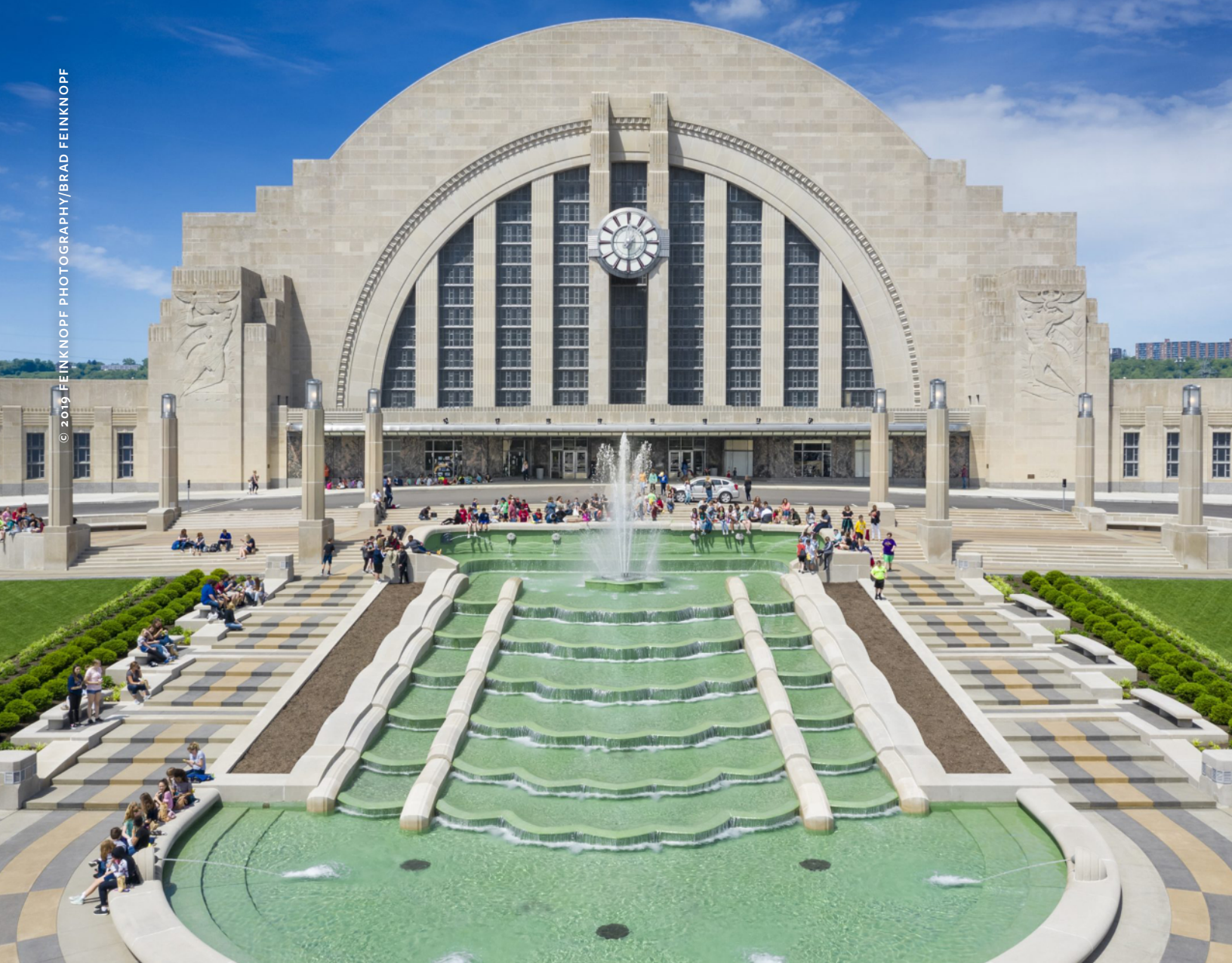
Fig. 1. Cincinnati Museum Center at Union Terminal.