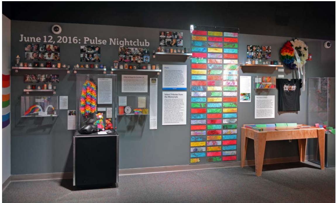
fig. 4. The exhibition's memorial wall took physical cues from Orlando's memorial sites. To visually reflect the innumerable candles left there, we used 49 votive holders with LED tea lights - one for each of the deceased - beneath small photographic portraits displaying their names and ages.

history appointments. Collecting this impact on our Central Florida community means continuing to reach out in the years to come, to follow the lives of every person this event touched.