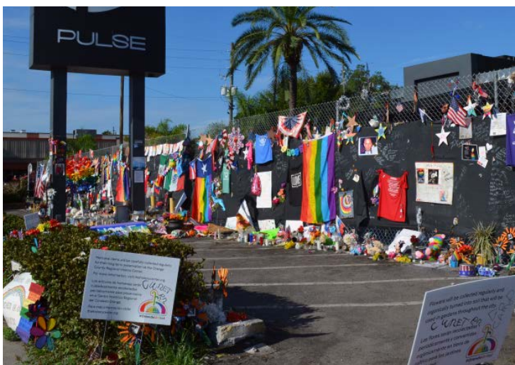
fig. 3. Pulse Nightclub on July 21, 2016 (top), the first day the collection team visited, and August 10 (bottom), after almost three weeks of history center maintenance and thousands of visitors. Note the bilingual signs in the foreground; they informed visitors what would happen to the items they left.

Orlando and set an opening date of October 1, 2016 to coincide with “Come Out With Pride,” Orlando’s LGBTQ pride festival. 4