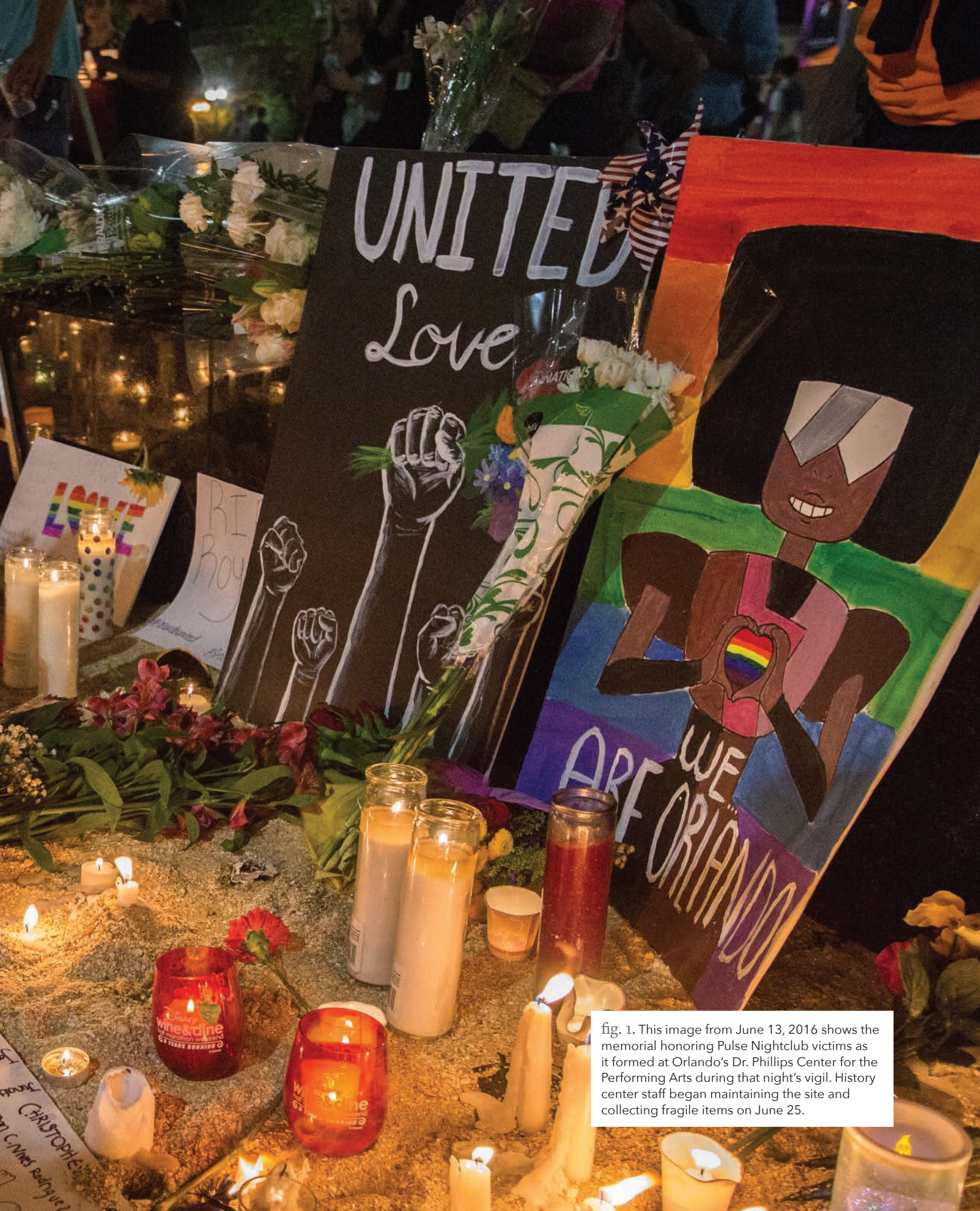
fig. 1. This image from June 13, 2016 shows the memorial honoring Pulse Nightclub victims as it formed at Orlando's Dr. Phillips Center for the Performing Arts during that night's vigil. History center staff began maintaining the site and collecting fragile items on June 25.