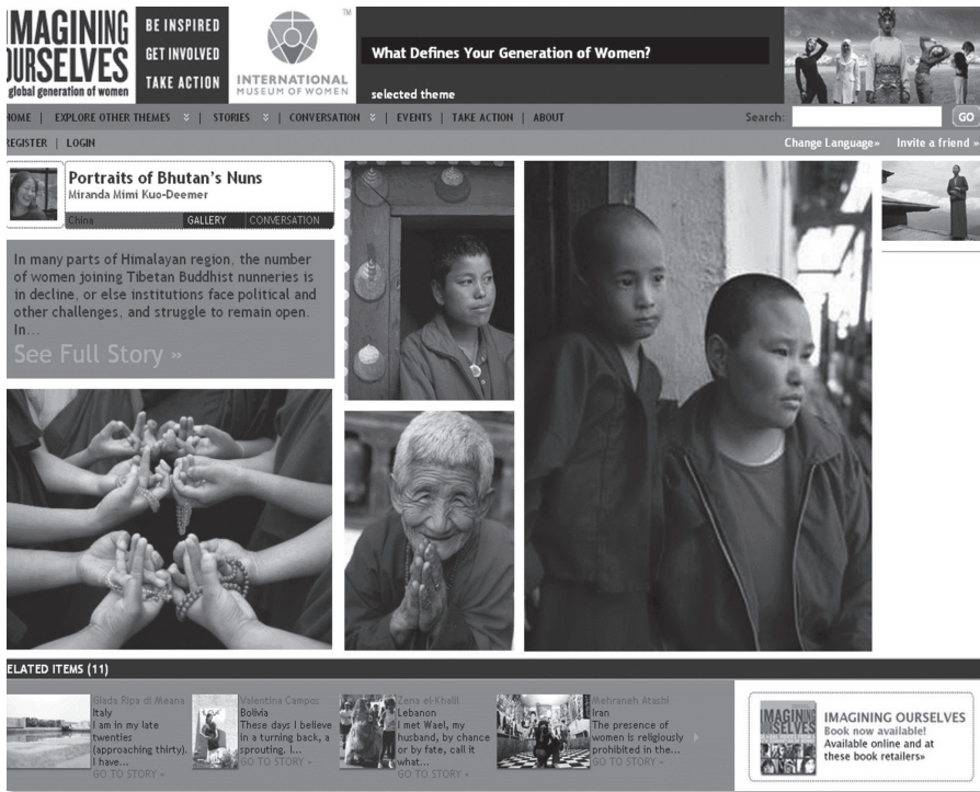
The Imagining Ourselves exhibition curated artistic content about and by women from all over the world.