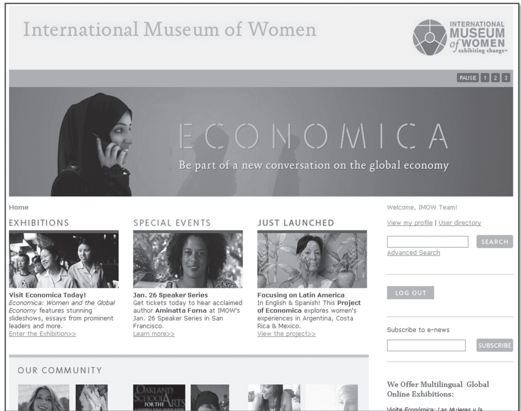
IMOW's current exhibition Economica highlights the role that women play in the global economy.