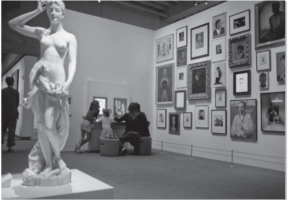
Interactive portrait wall in the Gallery of California Art at Oakland Museum of California. Self-portraits drawn on gallery computer by visitors cycle through the screens on the wall of portraits.

What is it to make a self-portrait? Which lines do you make as you go? Which opportunities will you take along the way, which leave behind? What is the tone you wish to strike—or, having struck one, to balance, change, accept, reject?