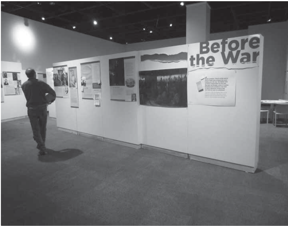
Minnesota History Center: Mock-ups of an exhibition-in-development about the Dakota Wars showing comments on post-its by Dakota descendants.