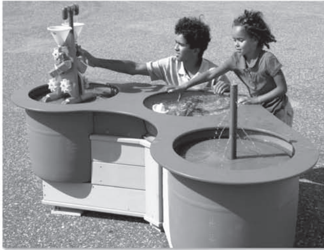
Triple Barrel water table constructed with recycled/reused materials by KidZibits.

Graphics Department at SMM also asks for any graphic back before it gets thrown out. They then determine if they can salvage anything to get re-used. They have found that most of the time they can strip the old graphic off and re-use the substrate. The folks at SMM estimate that substrate use has been cut in half (at least) by this effort of reuse.