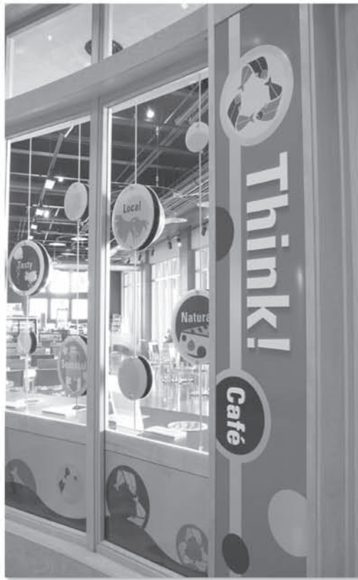
Entrance to ECHO's Think! Café .