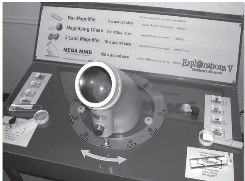
View of a rejuvenated and recycled magnification exhibit at Explorations V Museum.

It is often difficult to separate advertising hype (aptly labeled “green washing”) from real information about the materials and processes involved in the formation of specific products.