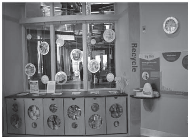
Recycle and Weigh Station. Think! Café exhibit area where visitors can learn about recycling as well as weighing the "waste" from their lunch.

ECHO Lake Aquarium and Science Center at the Leamy Center for Lake Champlain: http://www.echovermont.org/echo/think.html . The Think! Café is a place to purchase primarily locally-produced food, but it is also an exhibit area that gets visitors at ECHO to focus on the many types of decisions involved in making "green" choices. Throughout the Think! Café , information on the vendors and materials is highlighted alongside simple activities involving aluminum café trays, an interactive scale for weighing trash left from lunch, and a recycle-and-compost center, amongst other interactive opportunities. The Think! Café is a unique, green-themed experience, with Wi-Fi, and stunning views of the Adirondack Mountains and Lake Champlain. What better setting to help visitors to appreciate the importance of green choices?