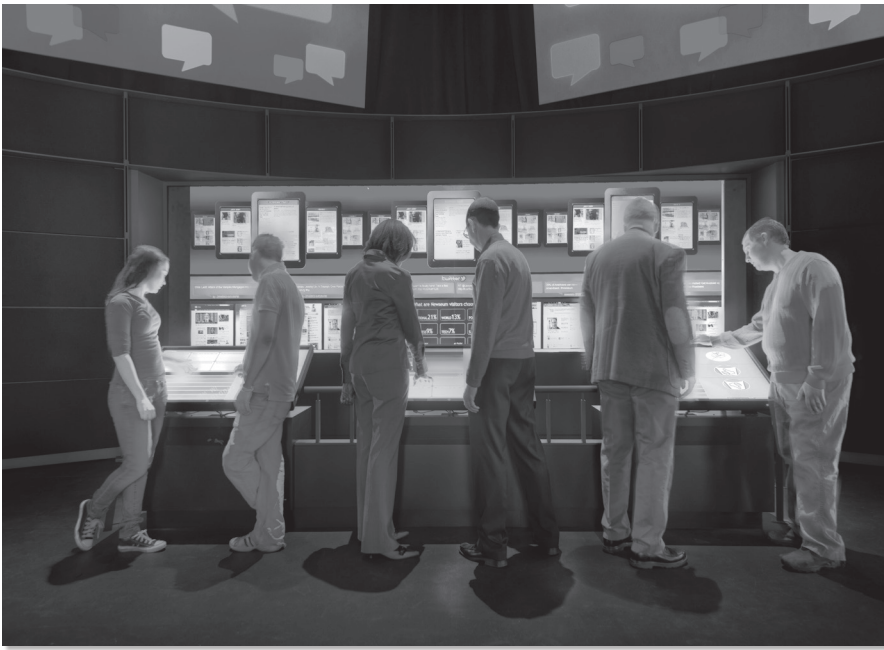
“Choose the News” exhibit.

and give it a thumbs-up, or discard it. The thumbs-up rating puts the story into their “Like News” circle. Once visitors have at least six stories in their “Like” circle, they can start building their own page.