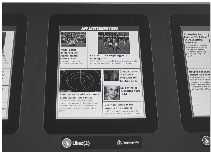
“Build Your Page” screen.

A sampling of the inappropriate titles: Your Daily Potty Post; Faggot; Rabies; F#ck bit cch; Fattazz times; SMEXINESS, look at me im naked; DILDO ENTERPRIZES; oh sh!t; square nipples; mr. nipples; your mom; tittie breath; Paulas dong is bigger than yurs; and wallstreetdickhole. One final note on the “Choose the News” process: