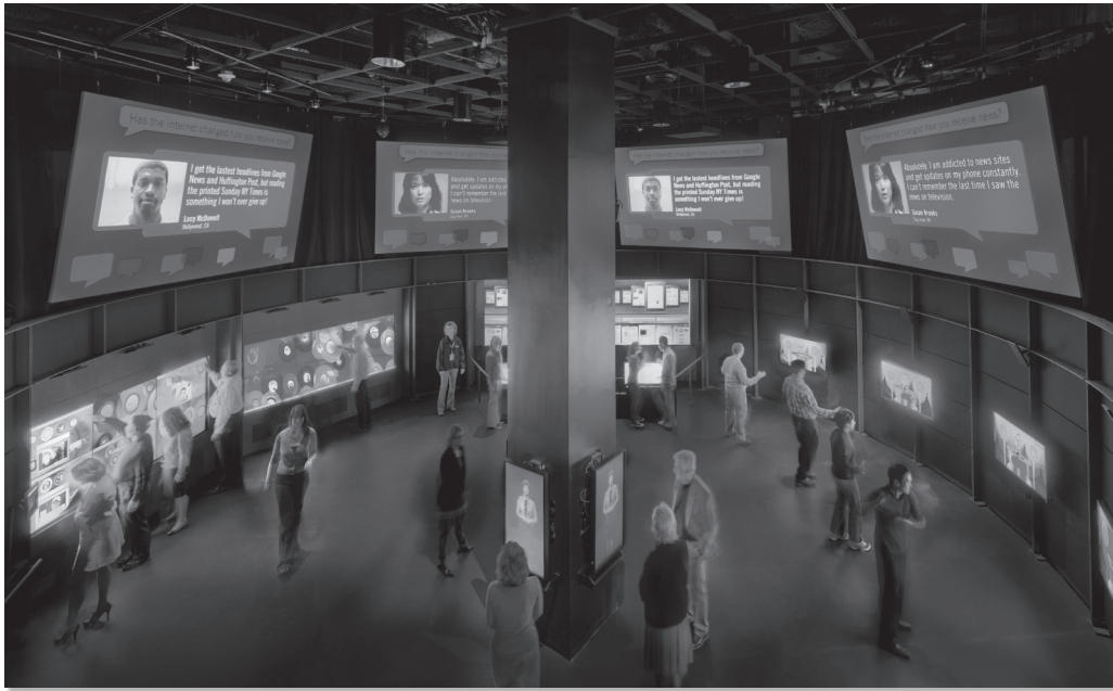
The HP New Media Gallery.

All of the content in the gallery is displayed on electronic devices. There are no text panels, no printed photographs, and no artifacts.