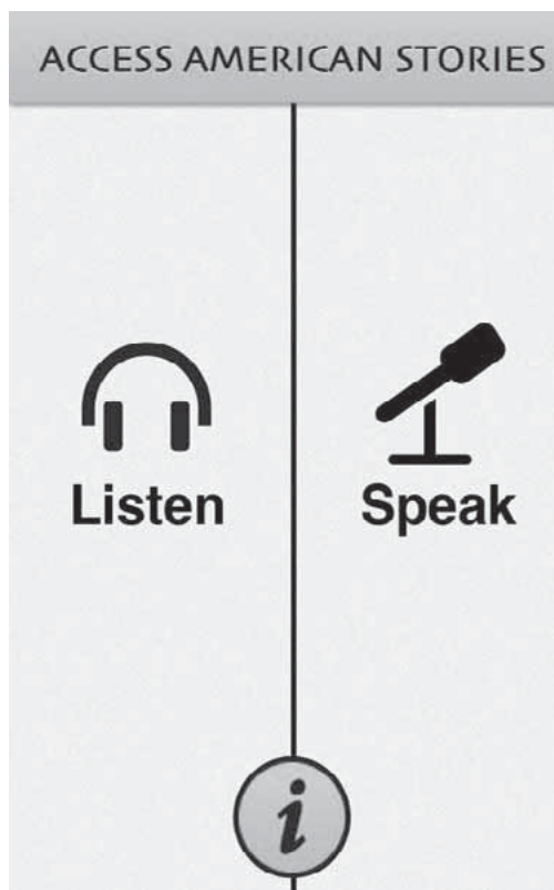
The home screen of the Access American Stories app offers two choices: hear the contributions of others (Listen), or add your own (Speak).

The video content created through this application can also be shared on the NMAH website, in-gallery kiosks, and Smithsonian social media platforms to further extend the reach of the program and increase return on investment.