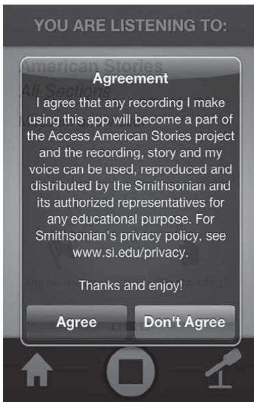
The click-thru release form users agree to before contributing verbal descriptions through the Access American Stories app.

The foremost objective and benefit of this project is to improve visitor experiences