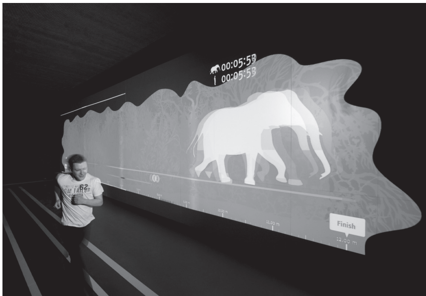
Footrace Tunnel—Race in progress.