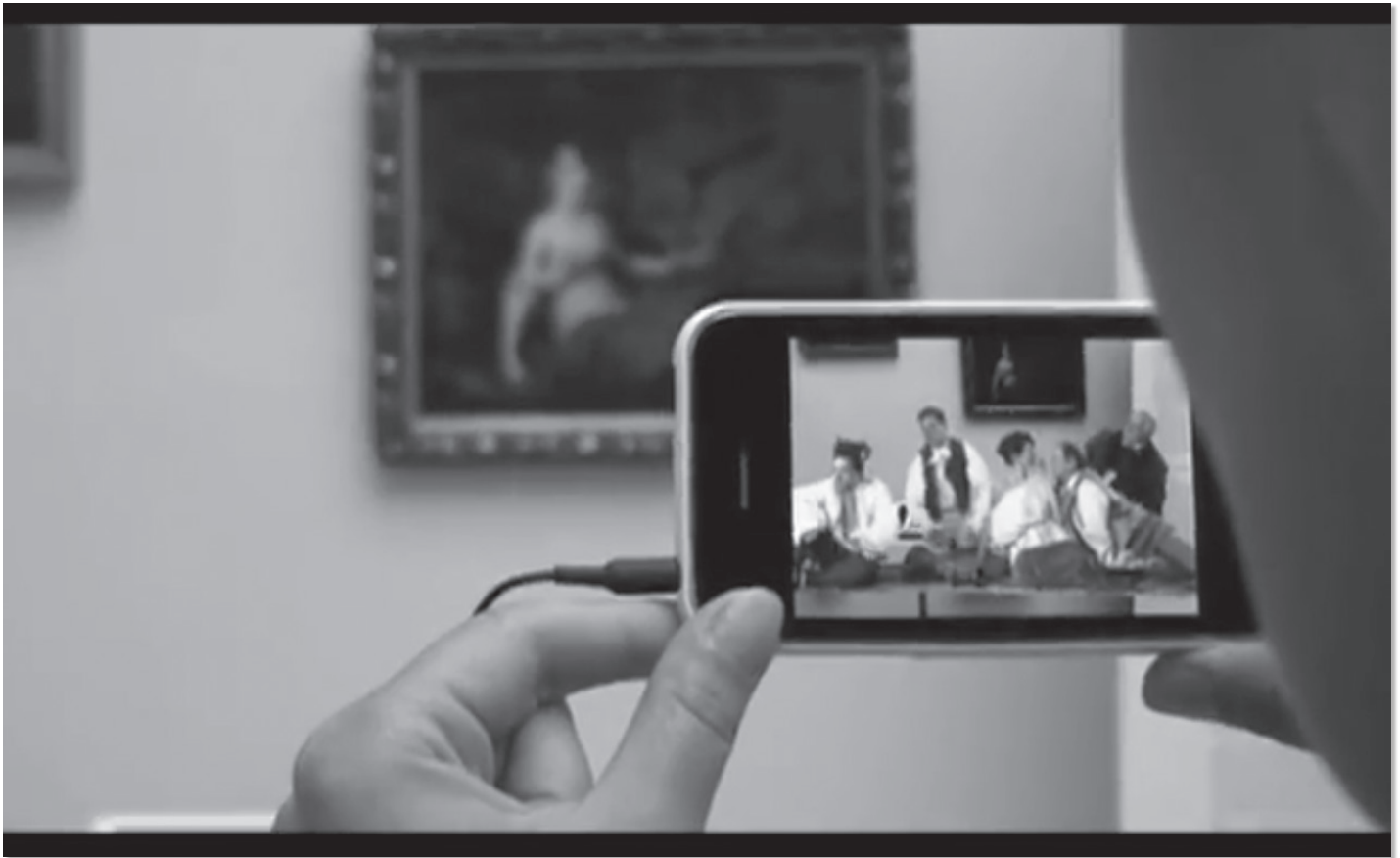
Screenshot from Sukiennice—Secrets Behind Paintings.

information about the objects in a highly engaging, at times soap operatic style, with the stories about the objects focusing on very human topics such as war, crime, madness, and lust. In the image on this page, for example, we see a visitor watching the film interpreting a painting that depicts a Polish noblewoman known for her lascivious behavior. In the film, the actress portraying the woman in the painting boldly and rather breathily states, “I don’t mind people calling me a whore, wanton, or a harlot. In every capital I have a lover. Sometimes more” (Leo Burnett Worldwide). Predictably, these films were highly popular, especially among younger visitors whose daily lives are highly saturated by media, and who may find a traditional museum display far too static. It was so popular, in fact, that as of April 2011, the augmented reality exhibition had attracted 20% of Krakow’s population (Leo Burnett Worldwide).