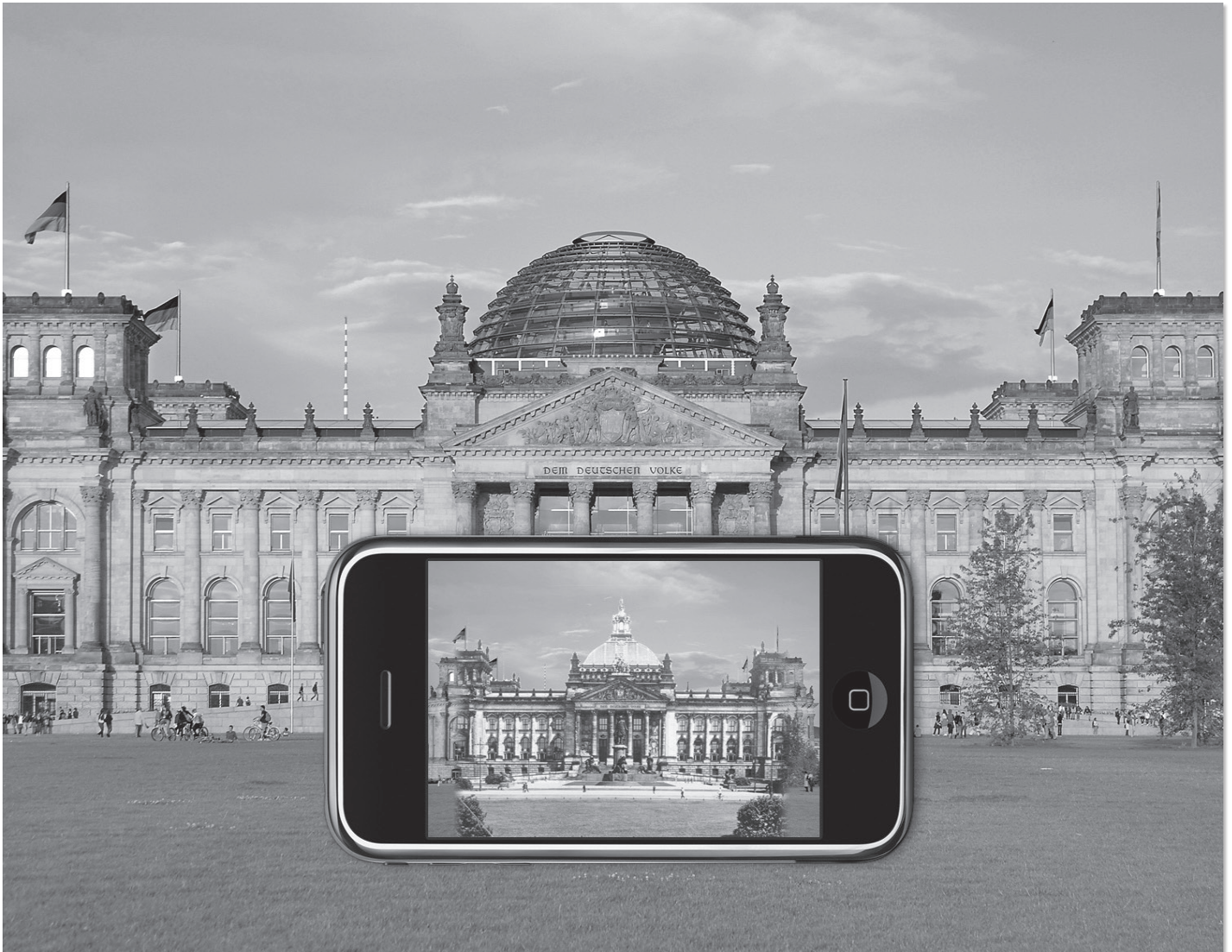
Reichstag screen graphic.

visitors simply see the abbey as it looks today reproduced on their screen. As they move through the space, however, what is now a garden renders on screen as the abbey's missing nave, giving visitors a good sense of the design and scale of the original structure in relation to the current site.