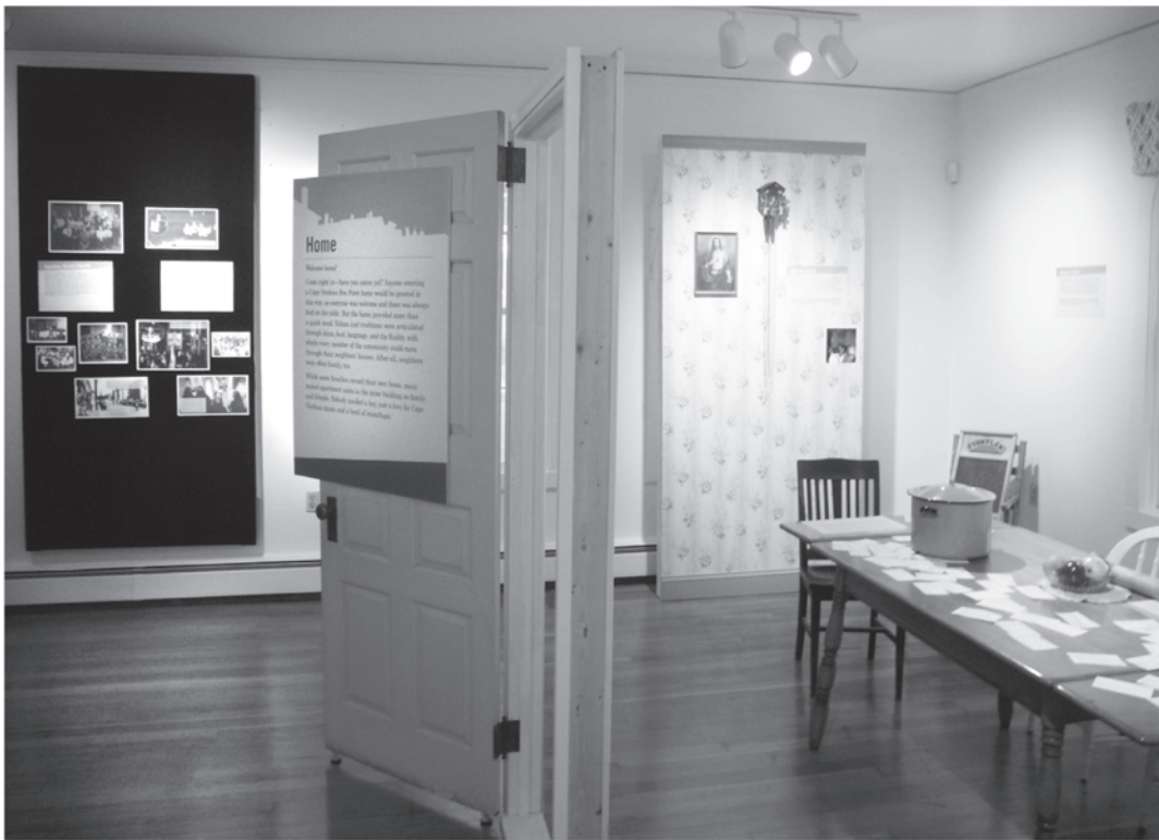
Part of the Home section. On the walls are objects found in many Fox Point homes; on the table reproduced recipes for visitors to take with them.