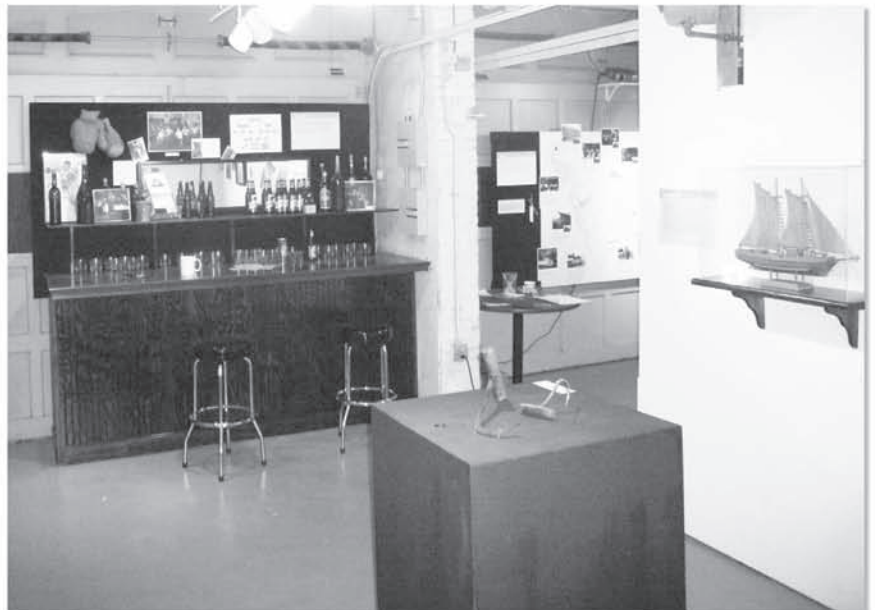
The Bar section, a reproduction based on images and including copies of historic newspaper articles and photographs, is tied to the Port section. To the right: the interactive map where visitors can tag locations in Fox Point with the stories.

What were some of their decisions? They decided on the categories of the exhibition first based on research, then on the space available, and changed them again based on further work with the designer. They chose important