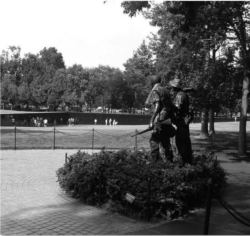
Maya's Lin's "Wall," from the south looking past Frederick Hart's sculpture from 1984.