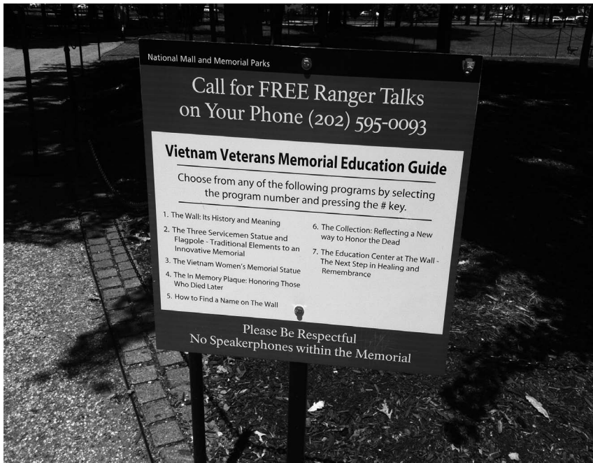
A sign advertises free cell phone Ranger Talks about the history and meaning of the Memorial.