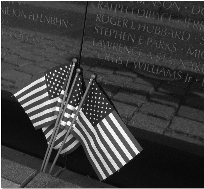
Flags left as mementos at the Wall.

“... the ability of a name to bring back every single memory you have of that person is far more realistic and specific and much more comprehensive than a still photograph...” Maya Lin