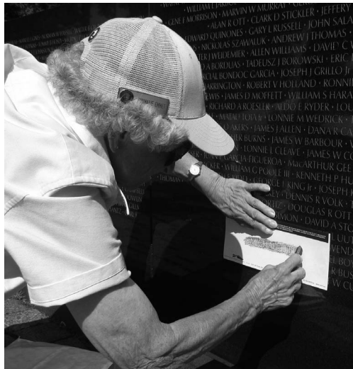
A visitor makes a rubbing of a name.

expect, when you round a bend in path and see the gash in the earth it comes as a surprise. Seen from a distance it is a dramatic gesture. In contrast to all of the other monuments on the National Mall that rise up above the ground here you gently descend below ground level.