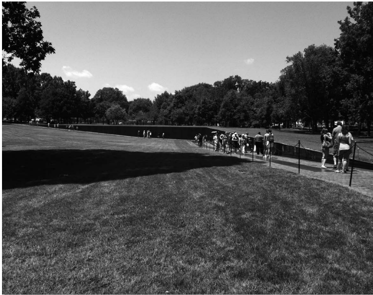
Entering the Vietnam Veterans Memorial.

as the year of casualty, while another family seemed frustrated as they realized the names were not listed alphabetically and ended up leaving the Memorial without locating the name they had come to find.