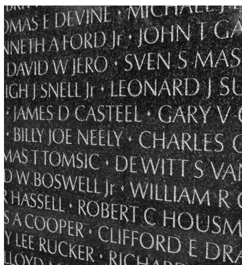
Names of Vietnam War dead carved into the granite Wall.