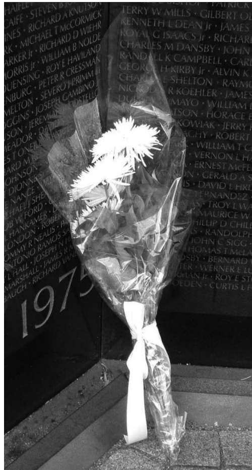
Flowers left at the apex of the two planes of the Wall.

That is not to say that the Wall is not moving. What Lin absolutely got right was the tone. In her submission (1981), she described “a quiet place, meant for personal reflection and private reckoning.” Indeed the shape of the site and the tapering of the walls creates a space apart,