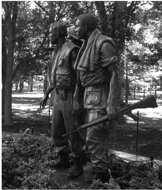
The Three Servicemen statue by sculptor Frederick Hart, added to the site in 1984.

D edicated nearly thirty years ago in November 1982, the Vietnam Veterans Memorial was initially the focus of intense criticism and controversy but today is one of the most visited sites in Washington, DC. Maintained by the National Park Service, the Memorial sits on a quiet two-acre site in Constitution Gardens just northeast of the Lincoln Memorial and includes not only Maya Lin's iconic "Wall" but also