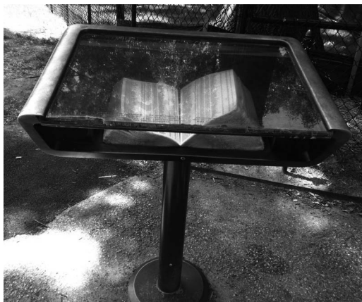
The Directory of Names helps visitors locate the names of service members listed on the Memorial.

about the Vietnam War, I couldn't help but think it sends a strong message about the human cost of conflict. I reflected on how the 58,272 names on the Wall really represent the lives of hundreds of thousands of people—families, friends, and comrades all affected by the casualties listed there. I looked around