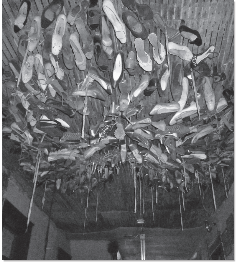
Shoes, shoes, and more shoes attached to the second floor ceiling.

rest on Freecycle, to the Salvation Army, Goodwill, or you may just send it all to the dump.