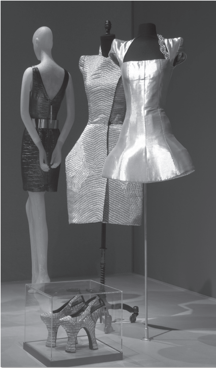
Dresses and shoes from the ARMOR section of the exhibition Daphne Guinness at The Museum at FIT.