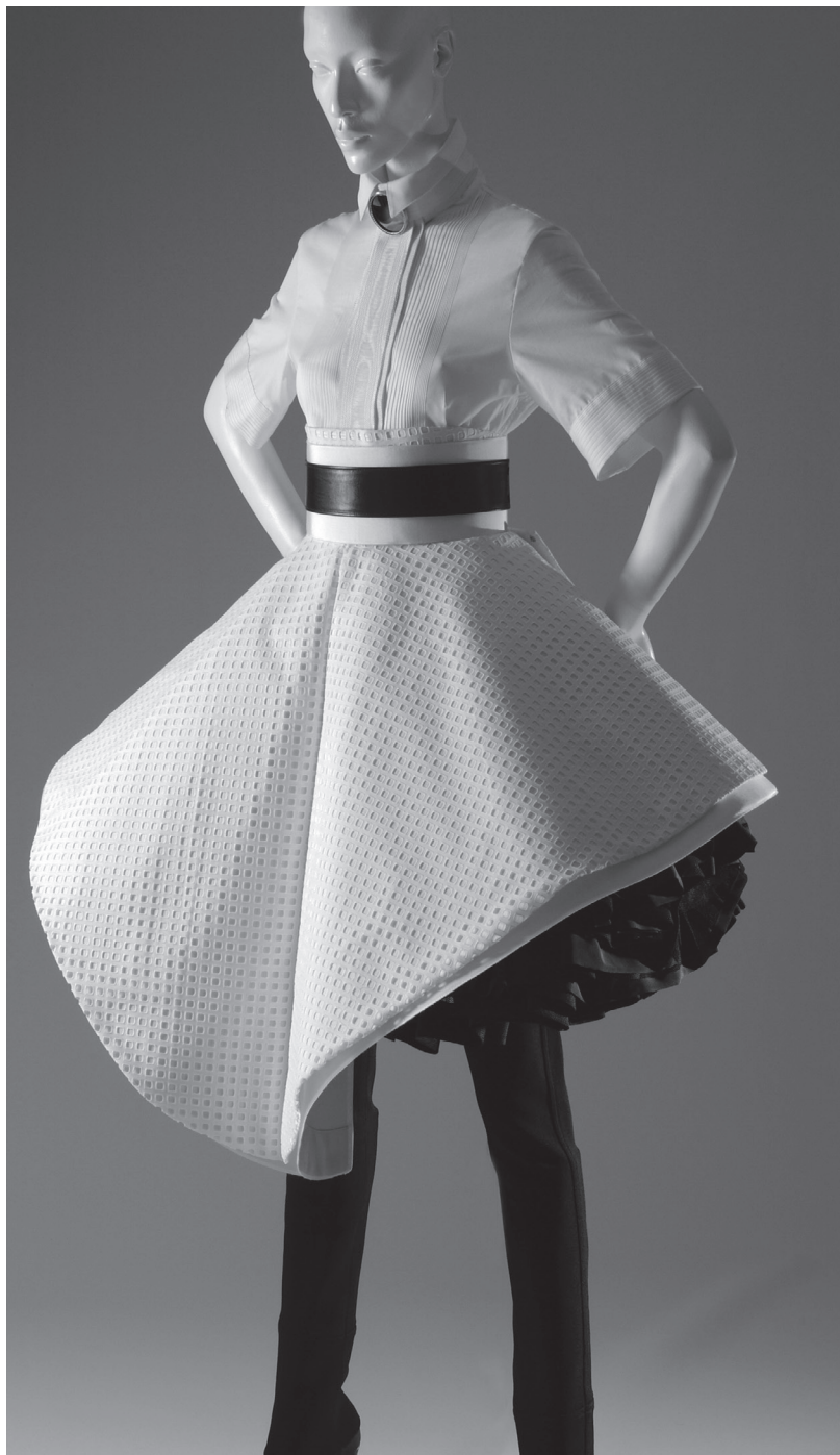
Boudicca (Zowie Broach and Brian Kirkby), ensemble, white cotton, black polyester net, black rayon stretch knit, black leather, Fall 2006, England, museum purchase.

As I was leaving the exhibition, I felt as though something was above me, watching. I then realized it was a hologram of Daphne in one of her garments. It gave an eerie feeling to the space—she was with you and watching over her beautiful couture. ✨