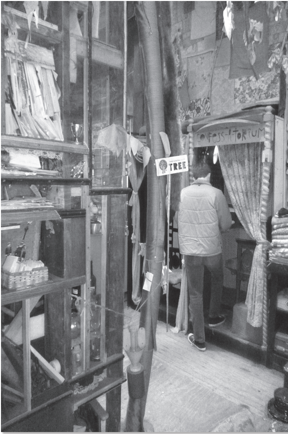
A visitor adds his response to the first floor "confess-a-torium".