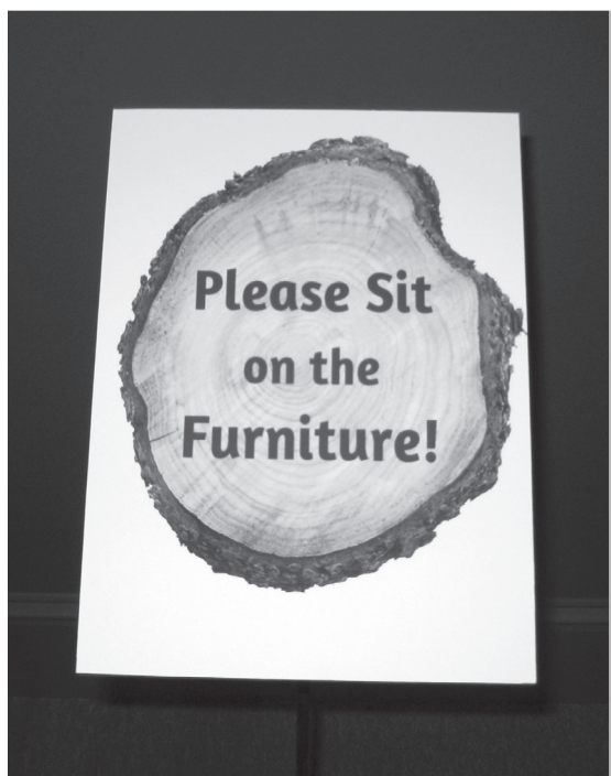
Friendly graphic encouraging visitors to try out the exhibit furniture.

I really enjoyed how the simple elements of this "urban recycling" story were displayed with both elegance and humor: signs encouraging you to "Please Sit on the Furniture!" as well as simple graphics and interactives that helped museum visitors appreciate all the steps from cutting down a tree to turning it into furniture.