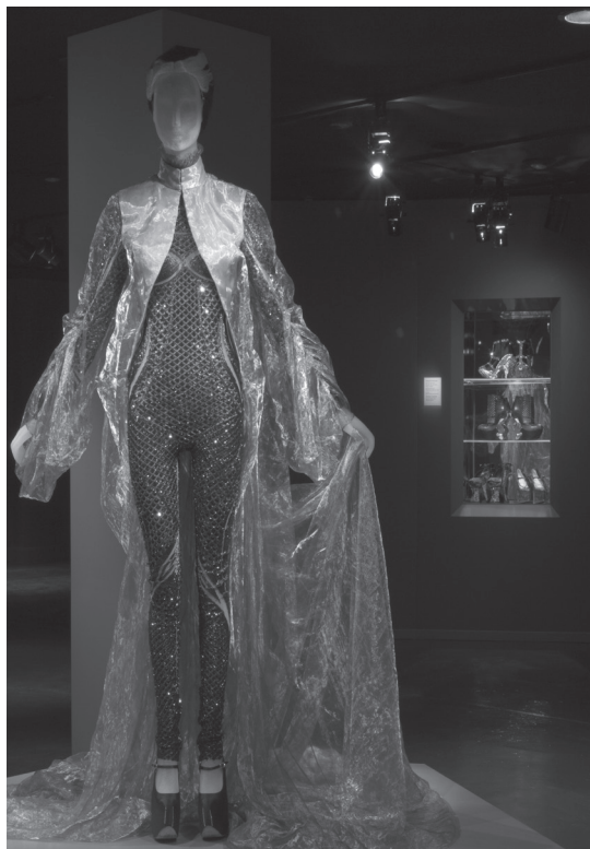
Alexander McQueen ensemble featured in the exhibition Daphne Guinness at The Museum at FIT.