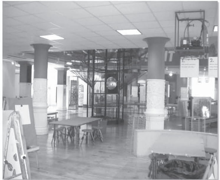
Natural light, natural materials (note wood floor, not concrete or carpet tiles), human-scaled and flexible components in this creative studio/exhibit area in the Children's Museum of Pittsburgh renovation make a comfortable and stimulating learning space.

that might be dragged through the facility. The renovation depended on reused building materials and high quantities of recycled materials that were locally manufactured and/or locally harvested. It has a white roof and considerable natural light. Their advice is: commit to the LEED process early, don't waiver in the face of complications and costs, and make sure that the LEED manager reports directly to the institution's management.