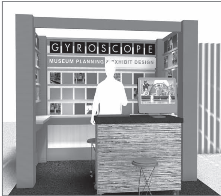
Made of light-weight cardboard and other green materials, Gyroscope's modular booth is small-scaled and designed for more personal, friendly exchanges—every picture can be picked up and looked at together.