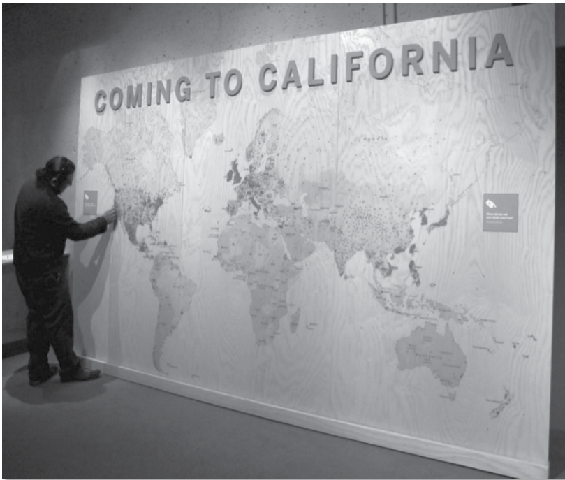
Upon entering the Coming to California gallery, visitors are asked, "Where did you and your family come from? Put a dot on the map." The exhibit was planned as an elaborate digital interactive element, and this was the simple prototype. After watching visitors engage with this simple prototype, and observing their animated intergenerational conversations, staff decided to retain the prototype version.