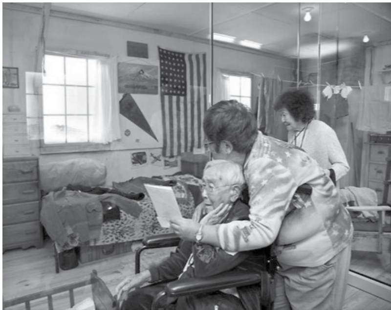
The barracks—a 16 x 20 ft room intended to house up to four adults—is the heart of Across the Wire: Voices from Heart Mountain. Artifacts such as furniture made by internees from scrap lumber and discarded fruit crates and props—like a chamber pot—help bring the space to life.

This permanent exhibition brings science to life in ways that are relevant and interesting to audiences and highlights the latest research and the process of scientific discovery about dinosaurs. The exhibition is organized around the major questions that drive scientific research on dinosaurs today such as: "What are dinosaurs?" "What was their world like?" "What were they like as living animals?" and "What happened to them?" The Excellence in Exhibitions Competition chose this exhibition for an award of special distinction because of its inventive and inspired framing of an often-told museum topic.