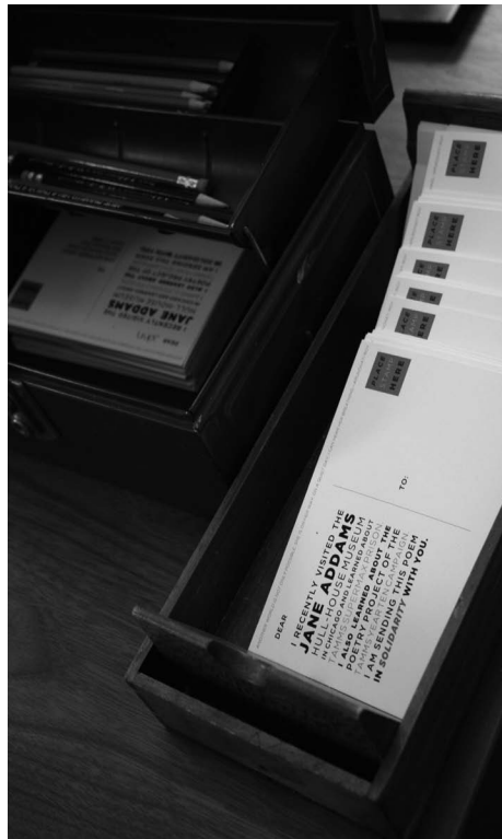
Postcards for prisoners at the Jane Addams Hull-House Museum.

But the power of historic sites is not inherent; it must be harnessed as a conscious tactic in the service of civic engagement.