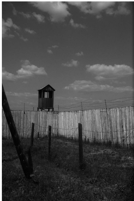
The watchtower at the Gulag Museum at Perm-36.

is the idea of “stimulating dialogue on pressing social issues.” The Coalition’s accreditation criteria elaborate that “We believe it is the obligation of historic sites to assist the public in drawing connections between the history of a site and its contemporary implications, and to inspire citizens to be more aware