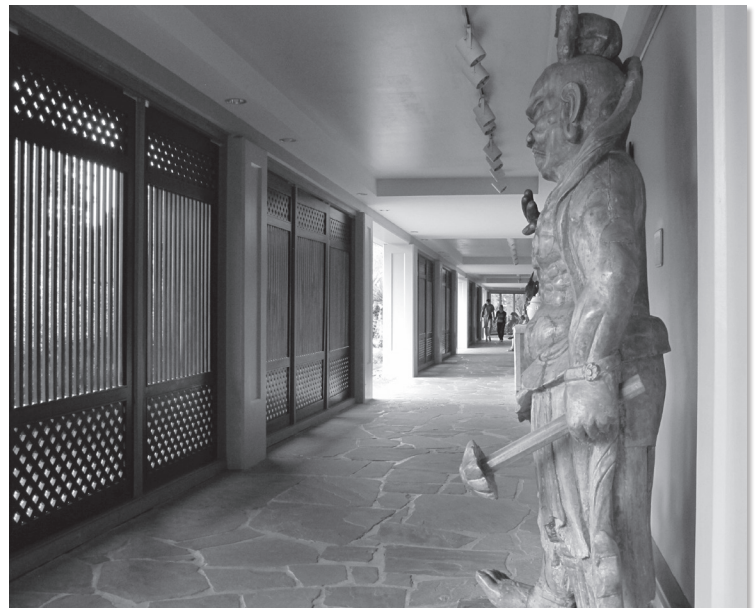
Section of the Museum Walkway, Hilton Waikoloa Village Resort.

Uncommon a generation ago, culturally-sensitive collecting and display techniques and visitor-centered approaches are now core aspects of professional ethics and best practice in public museums. Between government divestment of funds and the opening of new corporate museums, museum privatization is a growing global trend. Private museums are