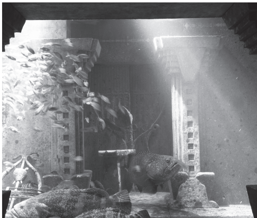
Aquarium in The Dig Atlantis Resort.

and authenticity. The labels provided do not generally support this interest, as they offer the date and location an object was collected, but make no connection to Hawaii; for that one must look to the few connections articulated in the self-guided tour booklet. What the labels do offer is a confirmation that the educational potential of an exhibition is recognized; but this art