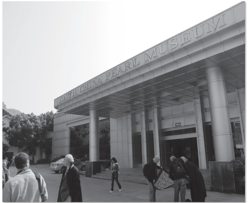
South China Pearl Museum, Guilin, China.

As museum professionals, we each possess a working definition of what we recognize as a museum. Disciplinary lexicons sometimes privilege narrower definitions; for example, art history texts may refer to the museum generically, meaning the art museum specifically. When new forms (e.g., science centers, virtual museums) have raised the question of what does and does not constitute a museum in practice (e.g., Cameron, 1971), the International Council of Museums (ICOM) definition has offered guidance. The terrain mapped by that definition has expanded significantly since the founding of ICOM in 1946. As I write, the definition is: "A museum is a non-profit, permanent institution in the service of society and its development, open to the public, which acquires, conserves, researches, communicates and exhibits the tangible and intangible heritage of humanity and its environment for the purposes of education, study and enjoyment" (ICOM, 2007). The ICOM Dictionary of Museology , to be published in April 2011 (cf. Desvalles and Mairesse, 2010), includes an annotated definition many pages long. Such an all-encompassing definition may leave one wondering what exhibition space is not museal? The technical answer still being, one that is in the service of profit rather than society; in other words, corporate museums are not museums as they ultimately serve the corporate stakeholders, not society. The practical answer—and a visitor's experience—is not as definitive.