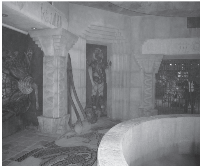
The Dig at the Atlantis Resort, Nassau, Bahamas.

Moving further to the right of the spectrum, we have the Museum Walkway at the Hilton Waikoloa Village, on the big island in Hawaii. The display of this hotel's art collection is the most likely to be perceived as a museum exhibition: it is named a museum, applies traditional art museum display techniques and labeling, and offers a guidebook (Goude, 2005) with information on the art and artifacts. This destination resort spans 62 acres, spread along the waterfront, isolated from any local communities. Guests must use a tram, boat, or mile-long walkway to get from one side of the hotel's grounds to the other. Most use the tram, which plays a recording directing passengers' attention to, among other things, the walkway exhibition, which was "...curated by a professional art curator. There are more than a thousand pieces to see... worth millions of dollars." This same short recording asserts the collection reflects the "cultural cross-section of many of Hawaii's earliest settlers" with pieces from Asia, Oceania, Western Europe, and Hawaii. The great majority of works are from Asia; relatively few are from ancient or contemporary Hawaii. Yet, the tram statement continues: "Through the art and display we hope you gain a greater understanding and insight into life in Hawaii." The website reinforces this interest in local culture