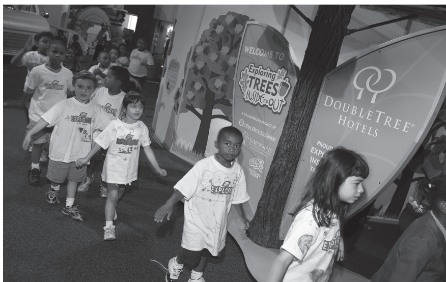
School classes arrive to visit the exhibit at Imagine It! Children's Museum in Atlanta.

lack of capacity in the host museums to release staff and volunteers to attend. This is an aspect of the project that we will probe further during the final evaluation.