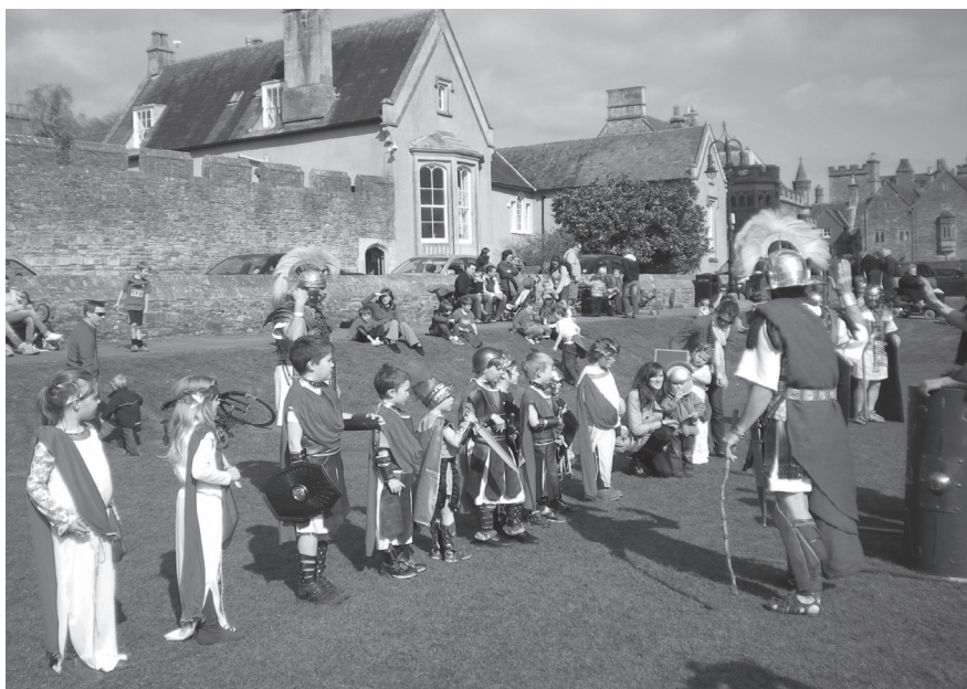
New recruits to the Roman army are drilled by a centurion at a Treasures from the Earth activity day at Wells and Mendip Museum.