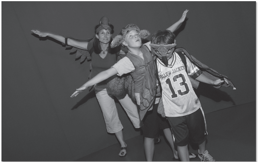
Soaring like birds in the blue screen experience of Exploring Trees at the Imagine It! Children's Museum in Atlanta.

Treasures from the Earth involved local communities in both the preparation of a local dimension to the exhibition at