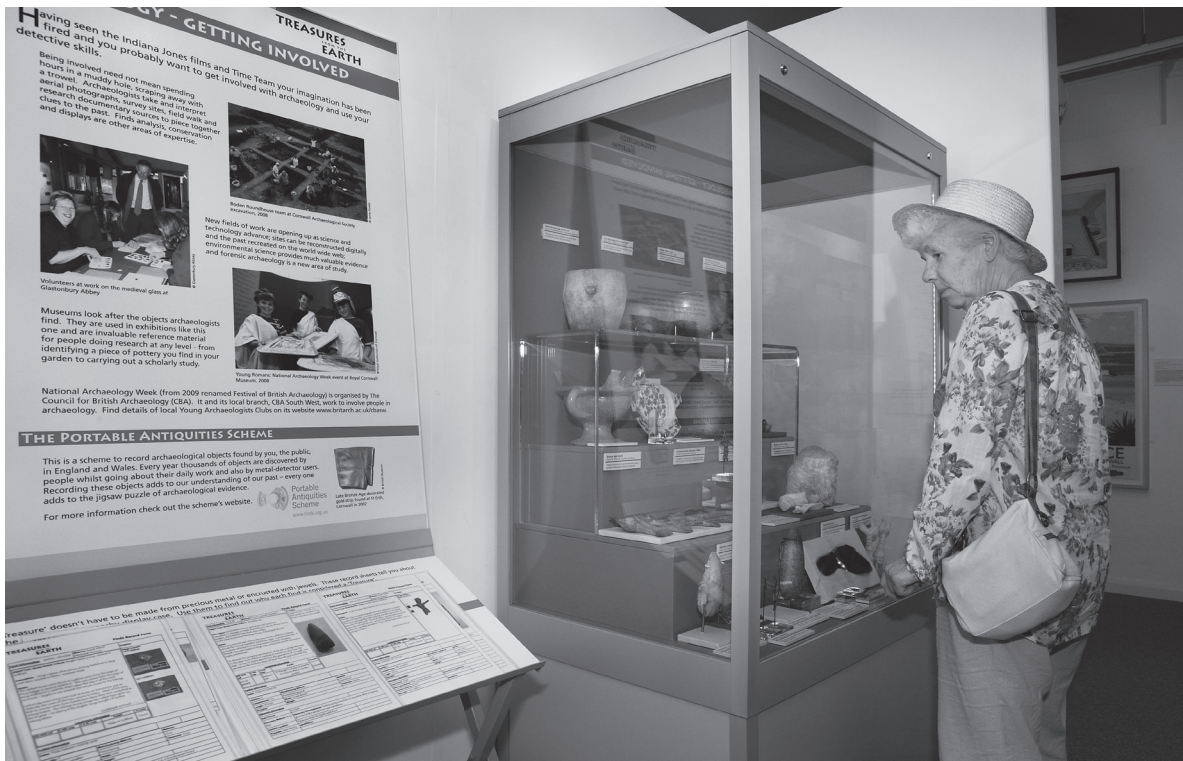
A visitor at Penlee House Gallery & Museum views a case of objects that toured with the show and one of the graphic panels.