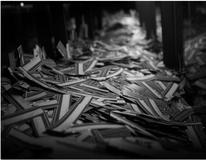
Growing collection of written pledges.