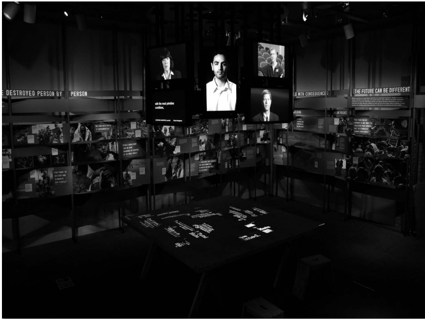
Video testimony, text, photos, and interactive elements are included in From Memory to Action: Meeting the Challenge of Genocide.