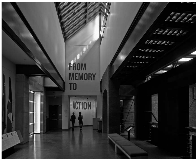
Transition from the permanent exhibition to From Memory to Action: Meeting the Challenge of Genocide.

The conclusion of the permanent exhibition is a quotation by Martin Niemöller, a German pastor and early Nazi supporter who was later imprisoned for opposing Hitler's regime. It is intended