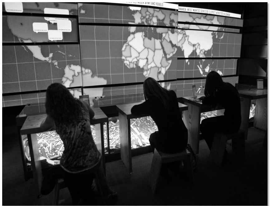
Writing pledges to act against genocide.

Underneath the videos is an interactive table where visitors can learn more about each eyewitness. Among the eyewitness stories presented are those of survivors and one perpetrator, in addition to other important voices: human rights advocates, prosecutors, journalists, humanitarian aid workers, and politicians. The story of genocide that the Museum wanted to tell is one of agency. Therefore, the videos