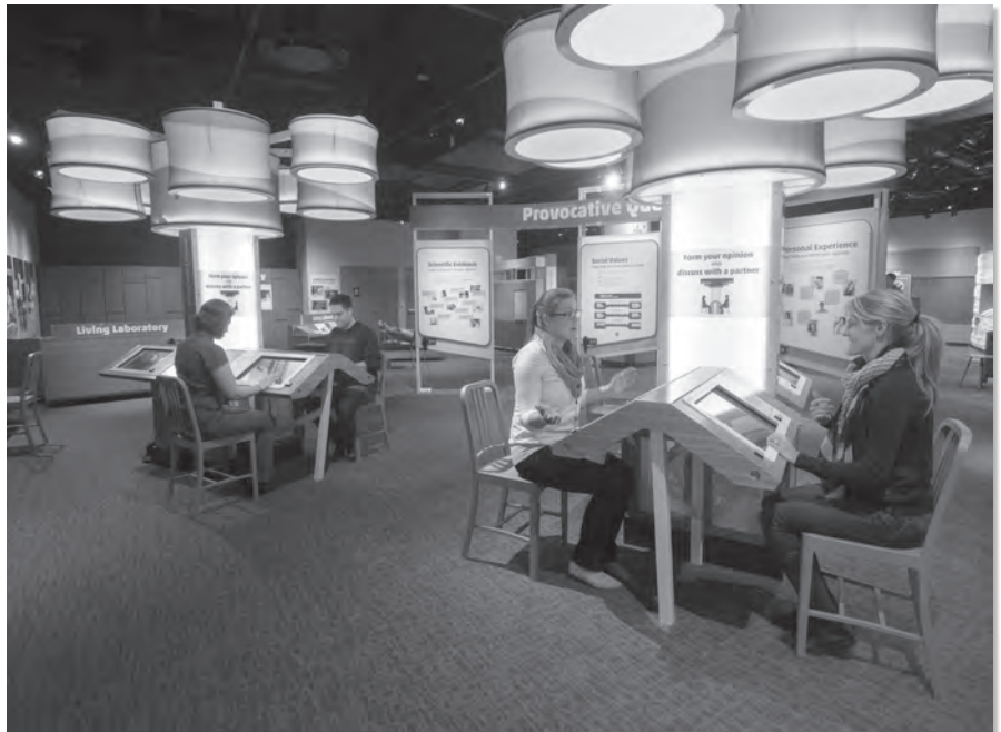
Figure 1. Provocative Questions exhibition.

Our final touchscreen design uses an interface where visitors navigate using