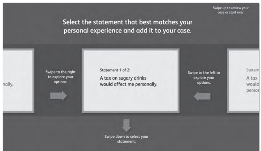
Figure 2. Screen design with gestural swipe instructions.

a gestural swipe in any location on the screen (fig. 2). The visitor moves between options, which are represented both visually and audibly, by swiping his or her finger across the screen, either left or right. If the visitor swipes his or her finger in a downward motion, their chosen option is selected, and both an audio