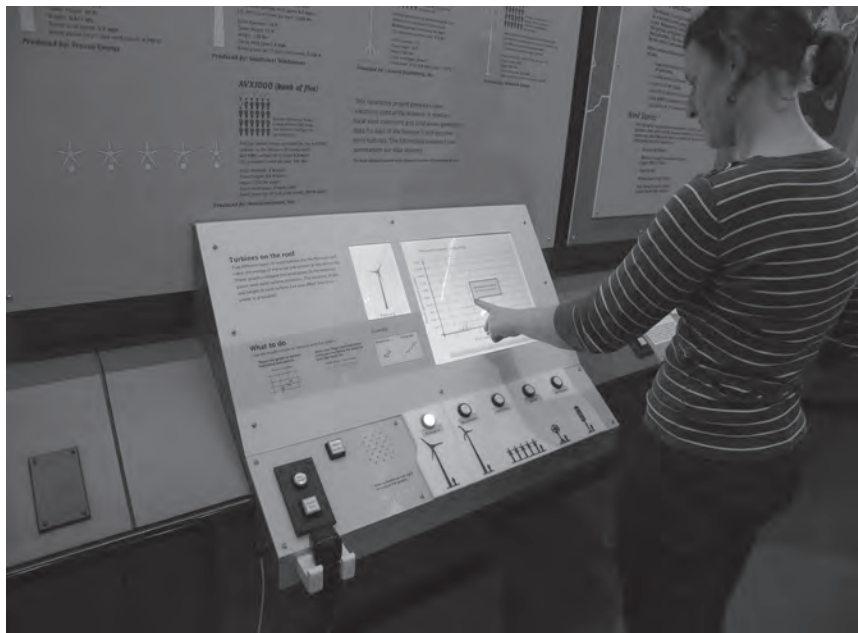
Figure 4. Touchscreen text and audio pop-up graph information.

accessible ATMs, smartphones, and classroom software.