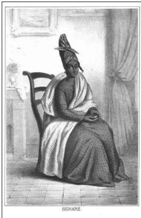
Portrait of a signare. From Boilat D. (1852, 1984). Esquisses Sénégalaises. Paris: Editions Karthala.

Deputy curator Eloi Coly assumed the role of head curator in 2008 after Ndiaye’s passing. But even today the existence of the Slave House museum on Gorée is intimately connected with Ndiaye’s work of some nearly 50 years. The interpretive script, an emotionally powerful narrative, remains largely unchanged. The Boubacar Joseph Ndiaye Socio-Cultural Center—a community-centered performance theater—opened on Gorée to the public in 2008. Everyday life on the small island of fewer than a thousand permanent residents is transformed daily by the massive influx of visitors it attracts from around the world. With some 12 ferry departures daily from the centrally located passenger port in Dakar, the 20-minute ride transports thousands of tourists and residents to and from Gorée every day, with thousands more converging on the island for special events. The site is a three-minute walk