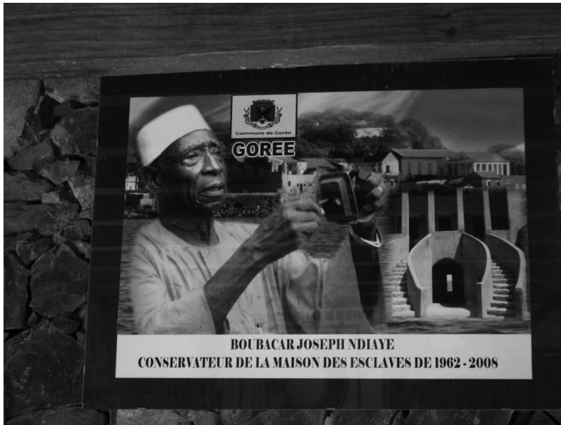
Entry sign at the Boubacar Joseph Ndiaye Socio-Cultural Center, opened in 2008 on Gorée.