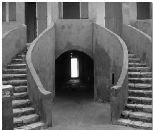
Staircase, the Maison des Esclaves.

Ndiaye created an original interpretive concept—that of a Door of No Return —referencing a ground floor door of the house that opens out onto the Atlantic Ocean and positioning it as a symbolic last point of departure from the African continent for the transit enslaved. The Door of No Return concept has since been repeated at numerous sites in Ghana and beyond. Wood doors from colonial