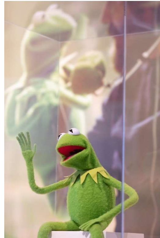
Sneak Peak of the Jim Henson Exhibition: Imagination Unlimited , May 26, 2023