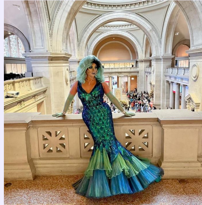
Bella Noche, Metropolitan Museum of Art

Anti-LGBTQ+ threats and protests target bookstores, libraries, community centers, and — yes — museums