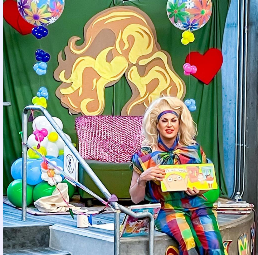
Pickle, The New Children's Museum San Diego