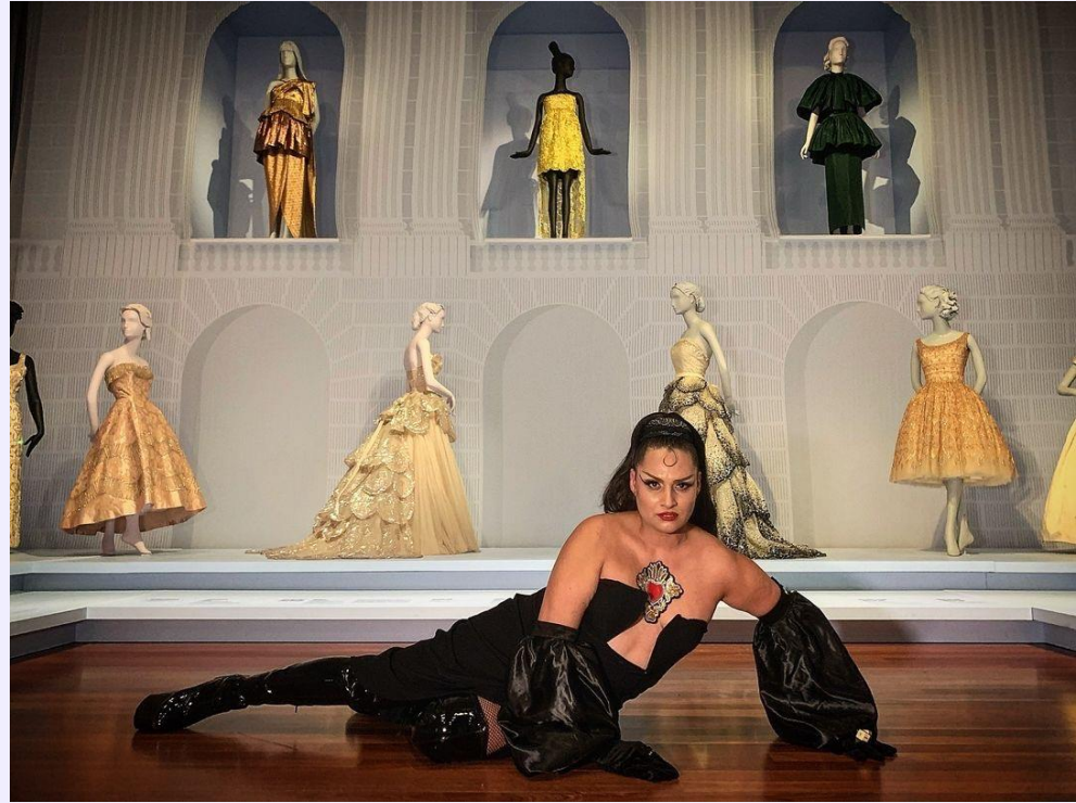
Per Sia, de Young Museum, San Francisco